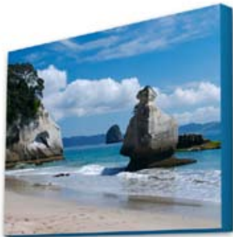
Colour for edge