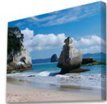
Image bleed for edge